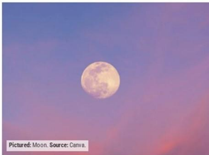
Pictured: Moon.