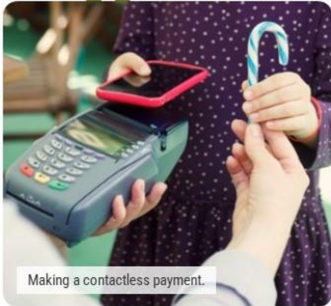
Making a contactless payment.

Look at the resource below, where some children share their experience of money.