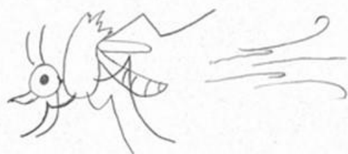
Pictured: A mosquito.