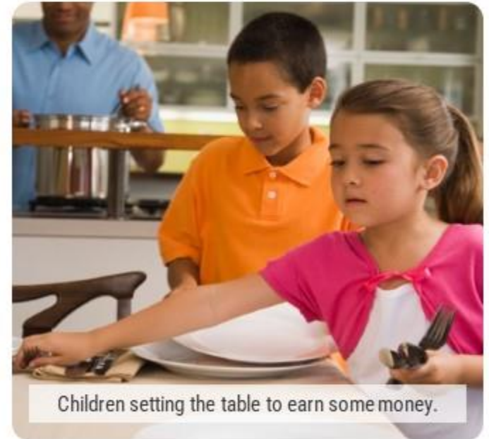
Children setting the table to earn some money.

Do you think being given money is a good idea? Why?