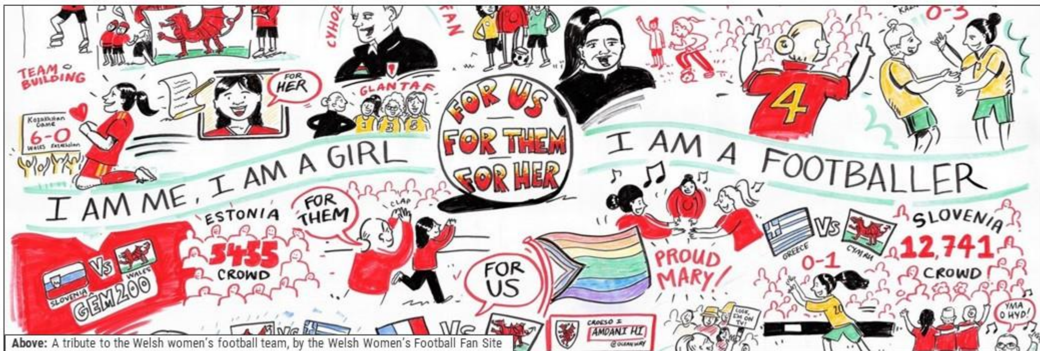
Above: A tribute to the Welsh women's football team, by the Welsh Women's Football Fan Site

A joint statement from Wales men and women's teams.