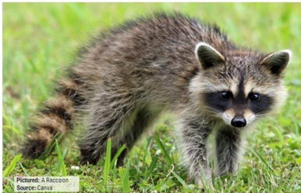
Pictured: A Raccoon

Share your thoughts and read the opinions of others