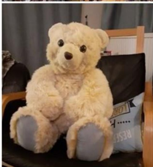
Pictured: Sinbad - before and after his restoration.