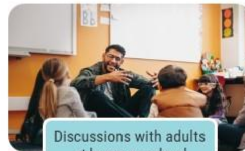
Discussions with adults at home or school

Can you think of any other ways you might learn about a set of important guidelines?