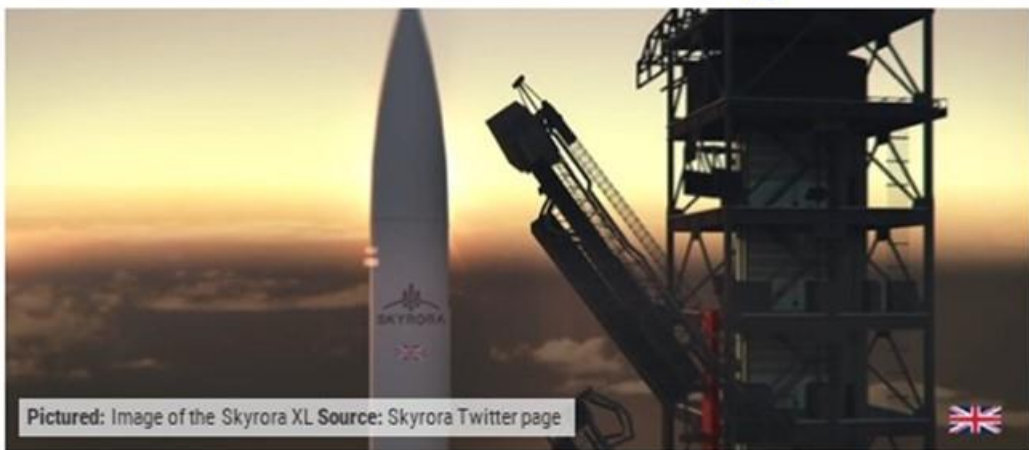
Pictured: Image of the Skyrora XL

Rocket firm, Skyrora, has confirmed that it has started tests on 3D-printed rocket engines, that could power UK space launches in the future! The tests will be carried out at the biggest rocket testing facility in the UK, in Midlothian, on the site of a disused quarry. The Edinburgh-based business that designs, manufactures, and deploys rockets Tweeted, 'We've officially commenced tests to qualify the updated design of our 70 kilonewton engine for commercial use on #SkyroraXL! 🚀 Produced via our #Skyprint2 printer, the new model can now be manufactured 50% faster at a cost reduction.' The company