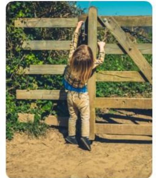
Real-life opportunities/experiencing something first-hand