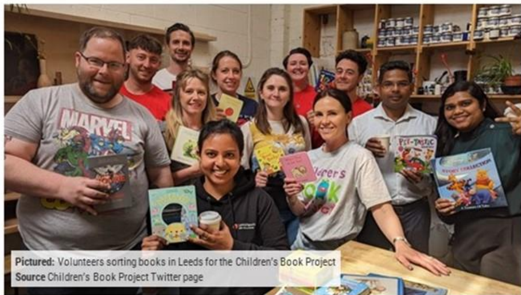
Pictured: Volunteers sorting books in Leeds for the Children's Book Project