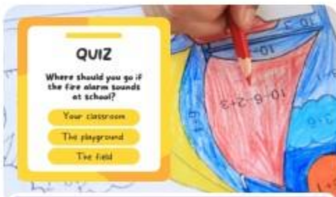
Completing quizzes or worksheets