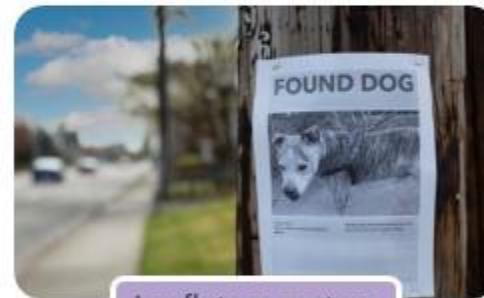
Leaflets or posters