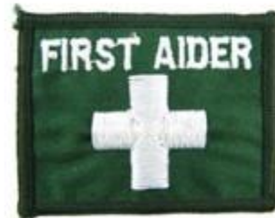
A bookmark, badge or sticker