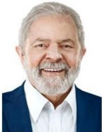
Above: President Lula of Brazil.

Lula said he is committed to helping the Amazon. In his victory speech, he said, 'Let's fight for zero deforestation. The planet needs the Amazon alive. A standing tree is worth more than tons of wood illegally harvested by those who think only of easy profit.'