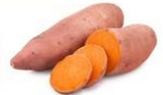
Pictured: Sweet potato

It is believed there are groups of people living in the Amazon rainforest, who have never had contact with the outside world. It is thought they live in harmony with the forest, using its resources for food and shelter.