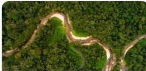
Aerial view of part of the Amazon rainforest.

Some groups live by the Amazon River. They hunt for fish and birds and harvest wild rice and crops (beans, pepper, coca, bananas).