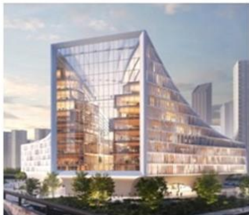
Pictured: Wuhan Library design images

Dutch architecture firm, MVRDV, has revealed its competition-winning design for the new Wuhan Central Library, which, when completed, will be among China's largest libraries! The stunning design for the new library is described as a 'Vast Canyon of Books'. It takes inspiration from its location, where two rivers, Yangtze and Han, meet. The two waterways are pulled into a central channel, replicated in the design of the building as visitors move through the 140,000-square-metre