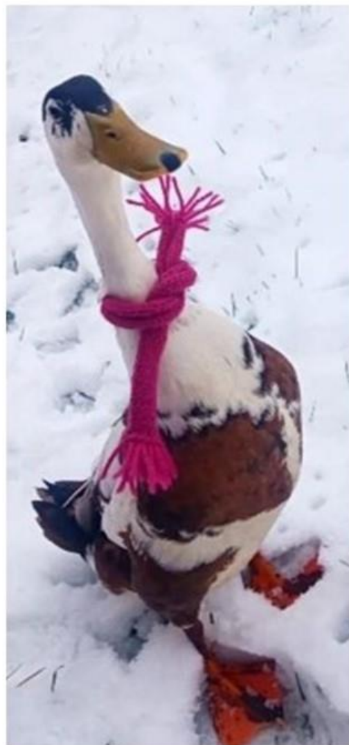
Pictured: Ham the duck