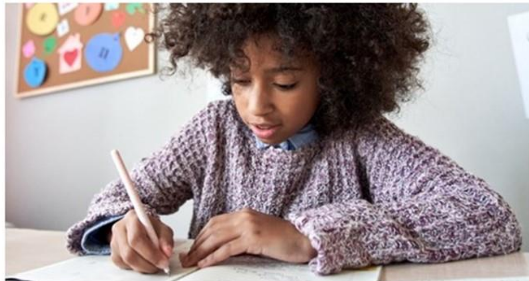
Pictured: Writing.

Share your thoughts and read the opinions of others