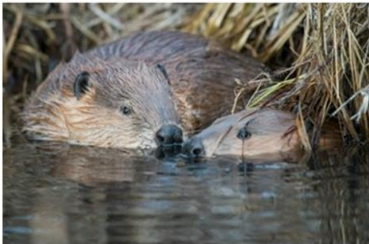
Pictured: Beavers.