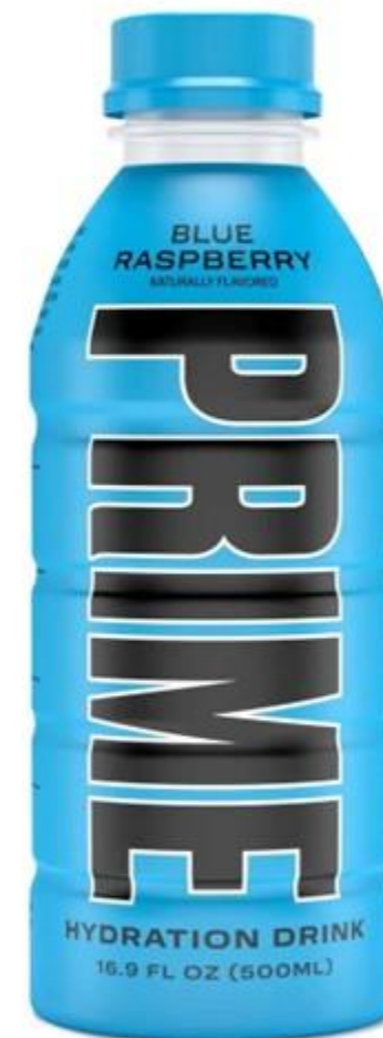
Pictured above: Prime Hydration Blue Raspberry flavour.

Prime Hydration comes in many flavours, including Blue Raspberry, Lemon and Lime and Ice Pop.