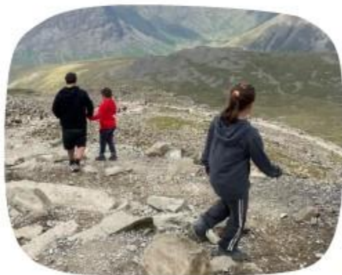
Descending Scafell Pike, England's highest mountain.

The experiences we have such as holidays, activities or challenges we overcome.