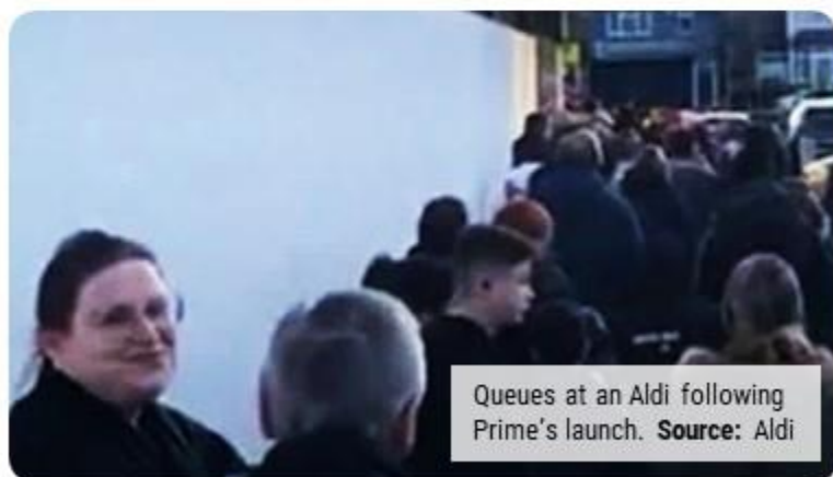
Queues at an Aldi following Prime's launch.