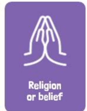
Religion or belief