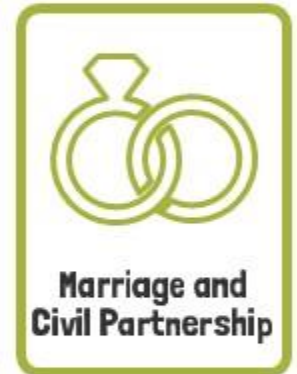
Marriage and Civil Partnership