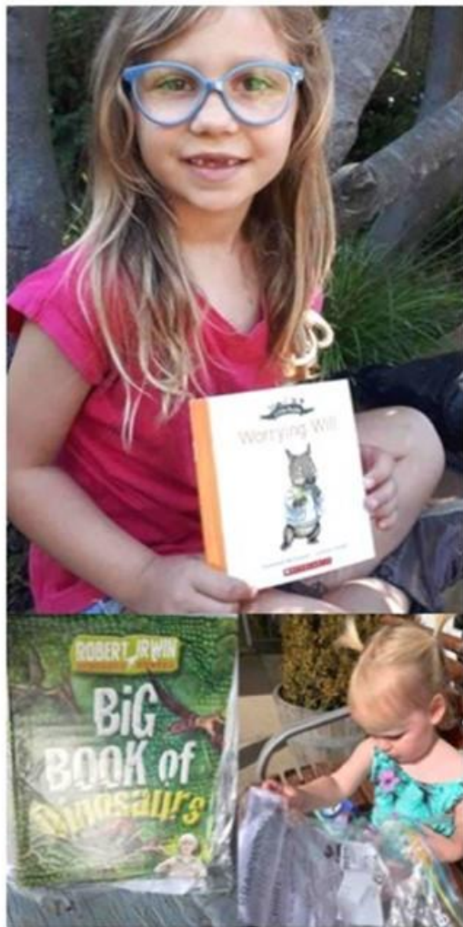
Pictured: Children enjoying the literary treasure hunt in Braidwood.

A literary treasure hunt is where children search for and find hidden books, read them and re-hide them for others. One such book hunt is based in Braidwood, a small town in the Southern Tablelands of New South Wales, Australia. A variety of books suitable for all ages of children are hidden all around the town, in locations such as shop windows, among shrubs, in parks, on benches and anywhere the children involved think would be a good hiding place for them. Each book is placed inside a plastic bag to keep it safe with a flyer that says: 'You are the lucky finder of this book. Read it, enjoy it, and then re-hide it for someone else to enjoy. Please reuse this bag. Add your name inside the cover and let's see how many can find it!' It has been reported that the people of Braidwood are enjoying the treasure hunt, after hearing about similar ones in other towns and setting up their own. 'It's lovely to watch the little kids' faces when they find the books, and it's just a little bit more magical,' mum of 5, Samantha Dixon said, adding 'I enjoy the fact these books are being read and are not just being left on the shelves and that kids are outside finding them not on screens.' Do you think this is a good idea for a treasure hunt? Can you think of anything else that could be hidden for a treasure hunt?