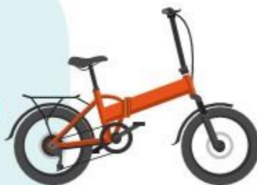
An electric bike