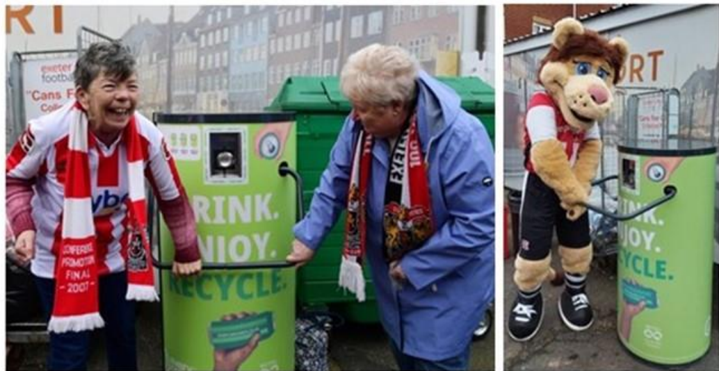
Pictured: Fans and Grecian the Lion mascot adding cans to the Cans4City collection.