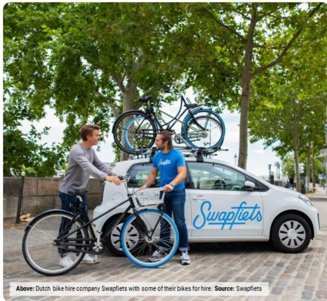
Above: Dutch bike hire company Swapfiets with some of their bikes for hire.