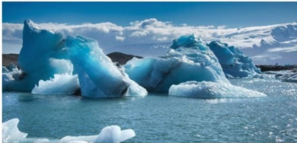
Pictured: Melting ice in Antarctica

50 rarely heard underwater sounds from the Antarctic and Arctic, recorded over a two-year period, have been released by researchers. Some of the weird and wonderful noises include, singing sounds caused by ice contracting and moving, a Ross seal that sounds like it is in space, a seismic airgun thundering like a bomb, and a crabeater seal that makes a noise like someone doing DIY. The project aims to highlight how noisy the oceans are becoming, due to increased human activity