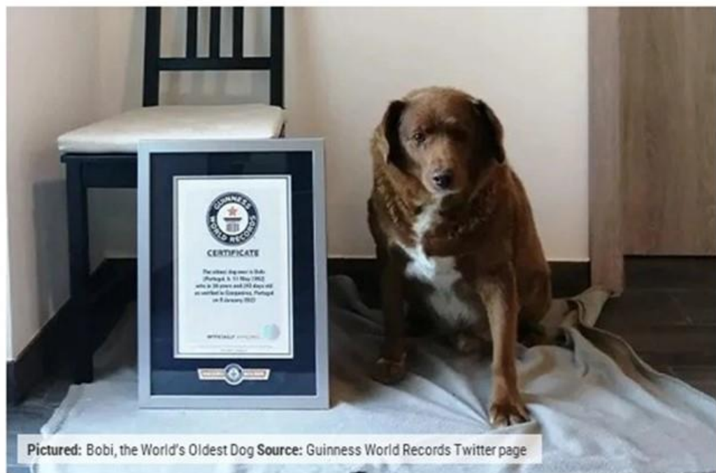
Pictured: Bobi, the World's Oldest Dog