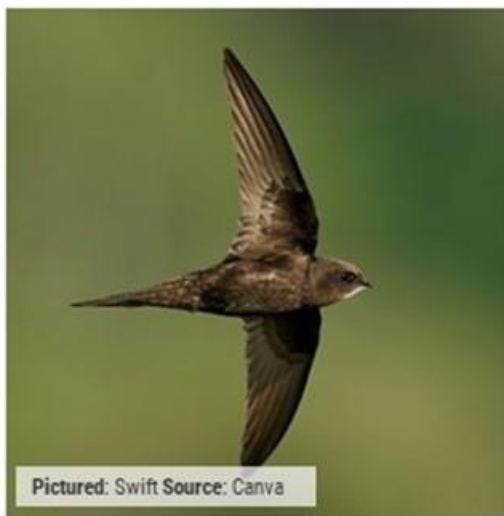
Pictured: Swift

10,000 bricks with built-in bird houses have been installed into UK homes to create nest holes for swifts. Swift bricks are normal building bricks with a hollow inside. The small migratory birds have suffered due to renovations of old buildings, which have sealed up the small holes that they would use to nest in. The nesting bricks can also be used by other small birds and it is hoped that they will help to increase declining bird populations. 'The great advantage of swift bricks and boxes is that they can work just as well in inner city areas with very little green space as anywhere else,' notes Dr. Guy Anderson,