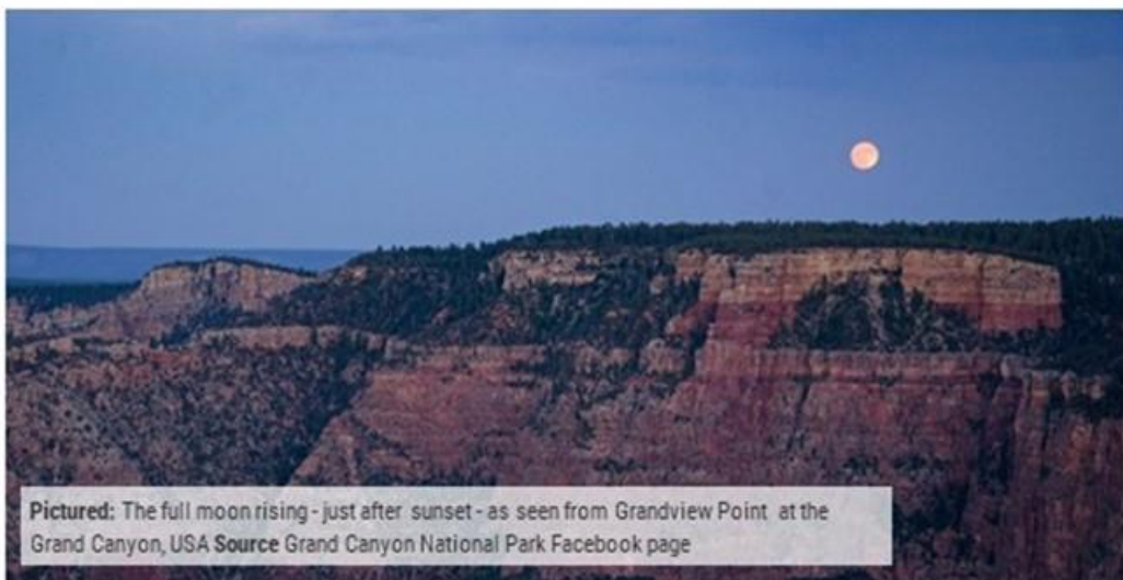
Pictured: The full moon rising - just after sunset - as seen from Grandview Point at the Grand Canyon, USA

An amazing supermoon has appeared in our skies for three days. A supermoon is when the Moon appears to be much larger than usual because it is closer to our planet. This happens as the Moon's orbit is not a perfect circle due to the Earth's gravitational pull, it is an oval shape. The Moon is less than 365,000 kilometres from Earth, which is around 22,000km closer than normal. The first full moon after Summer Solstice (the longest day, 21 st