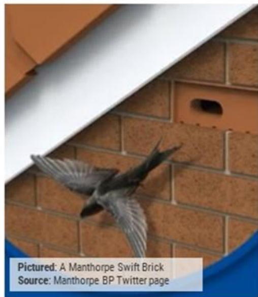
Pictured: A Manthorpe Swift Brick

the RSPB's migratory birds program manager. He adds that, 'Swifts can travel pretty long distances to find their insect food – all they need is a nest site.' Swifts are amazing flyers that spend 10 months of the year in the air. They have an impressive top speed of 69mph. They can do most things whilst still flying. They drink by skimming water as they fly over rivers and lakes with their mouths open. They eat by catching flying insects and airborne spiders. Astoundingly, they can also fly whilst closing one eye and turning off one half of their brain. They fly all the way to Africa before returning to the UK to nest.