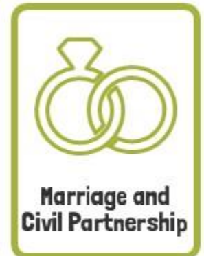
Marriage and Civil Partnership