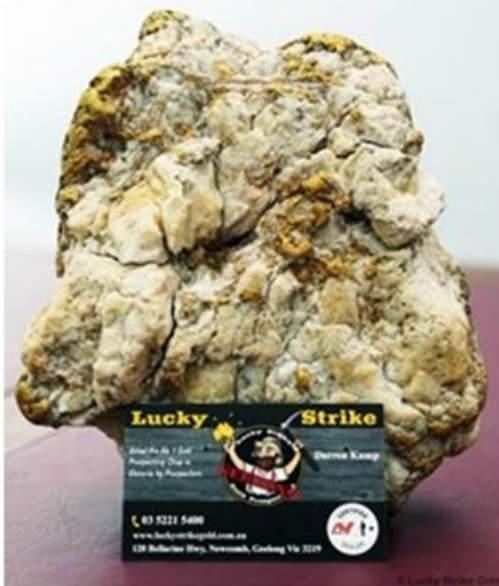
Pictured: Lucky Strike gold nugget.

many of the largest gold nuggets have been found there. The largest recorded to date being the 'Welcome Stranger' which weighed 72kg and was found in 1869!