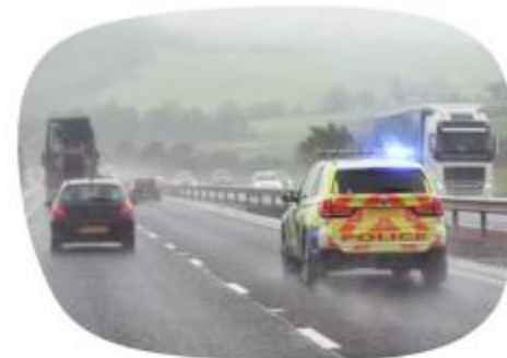
Emergency vehicle responding with blue flashing lights in the rain

High winds causing damage to power lines leaving homes without electricity for 24 hours.