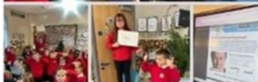
Pictured: Pictures sent in to us from Picture News schools.