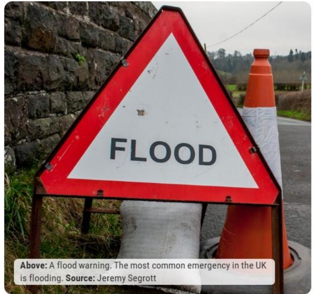
Above: A flood warning. The most common emergency in the UK is flooding.