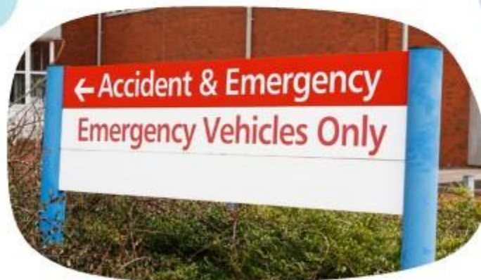
Signage for the emergency department at a hospital

A sunken tanker ship causing a major oil spill.