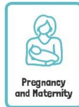
Pregnancy and Maternity