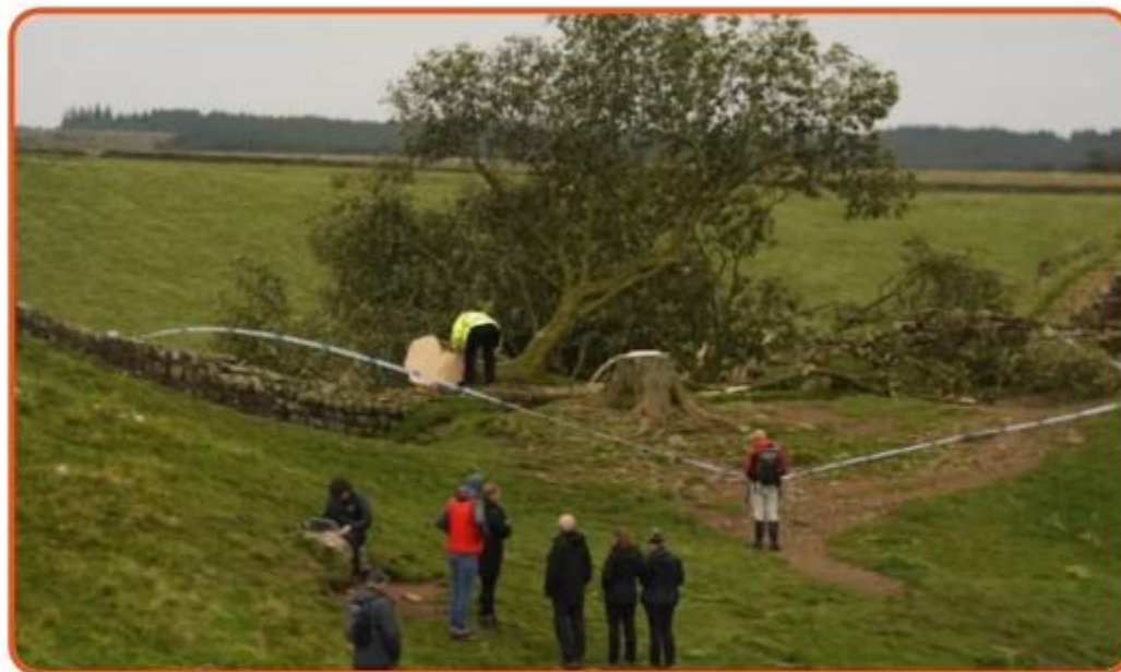
Pictured: The felled tree at Sycamore Gap.

On the morning of Thursday 28 th September, the National Trust confirmed that the tree had been 'deliberately felled' overnight. Currently, it is not known how or why the tree was cut down.