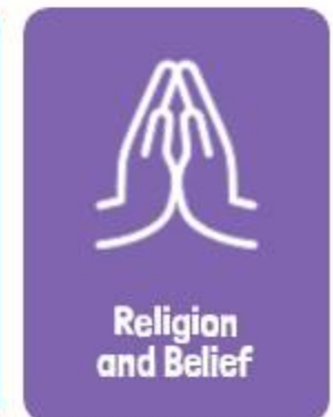
Religion and Belief