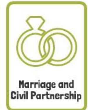
Marriage and Civil Partnership