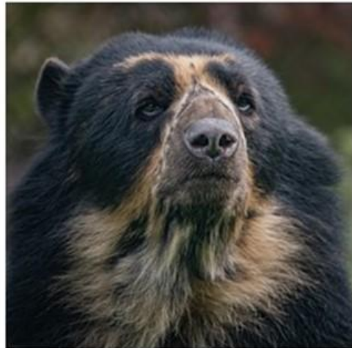
Pictured: Andean bear Oberon.