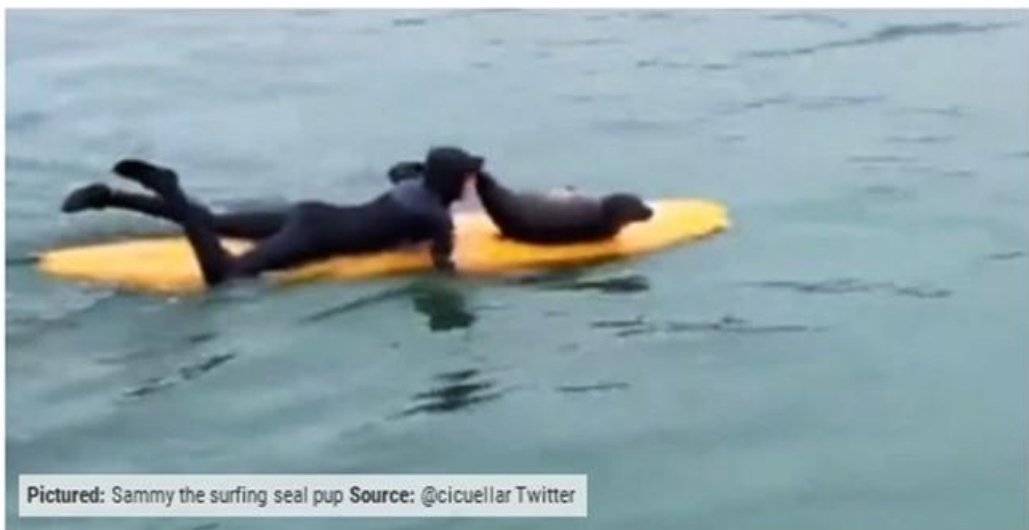
Pictured: Sammy the surfing seal pup

Surfers in San Diego received a surprise when they were joined by a seal pup! Typically, seals steer clear of humans, but not this baby seal! It was abnormally friendly and appeared unafraid as it proceeded to move from surfboard to surfboard, catching the waves. SeaWorld was notified and sent an expert crew out to check on the animal. Releasing a statement, SeaWorld officials reported, 'There was no need to intervene as the pup