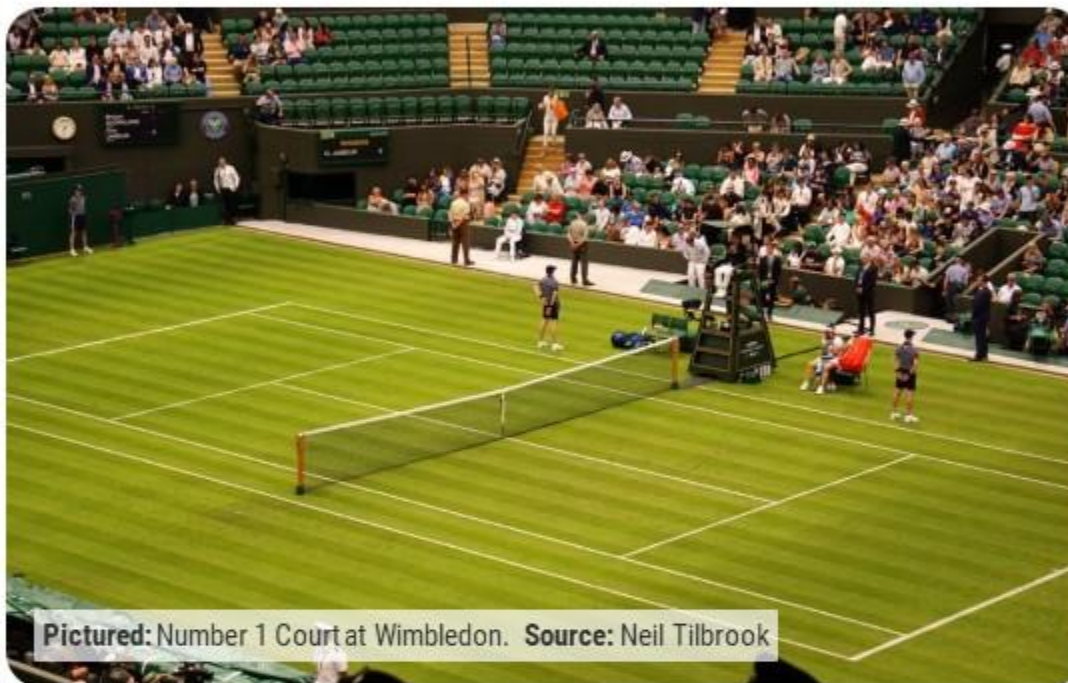
Pictured: Number 1 Court at Wimbledon.

Wimbledon has 18 Championships grass courts, 20 grass practice courts and 8 American Clay courts. It is the only Grand Slam tennis event still played on a grass court.