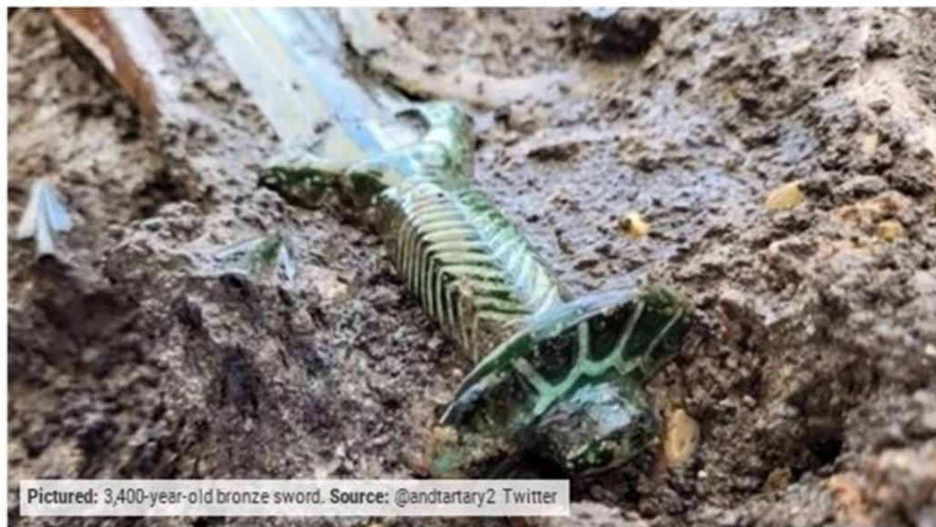
Pictured: 3,400-year-old bronze sword.