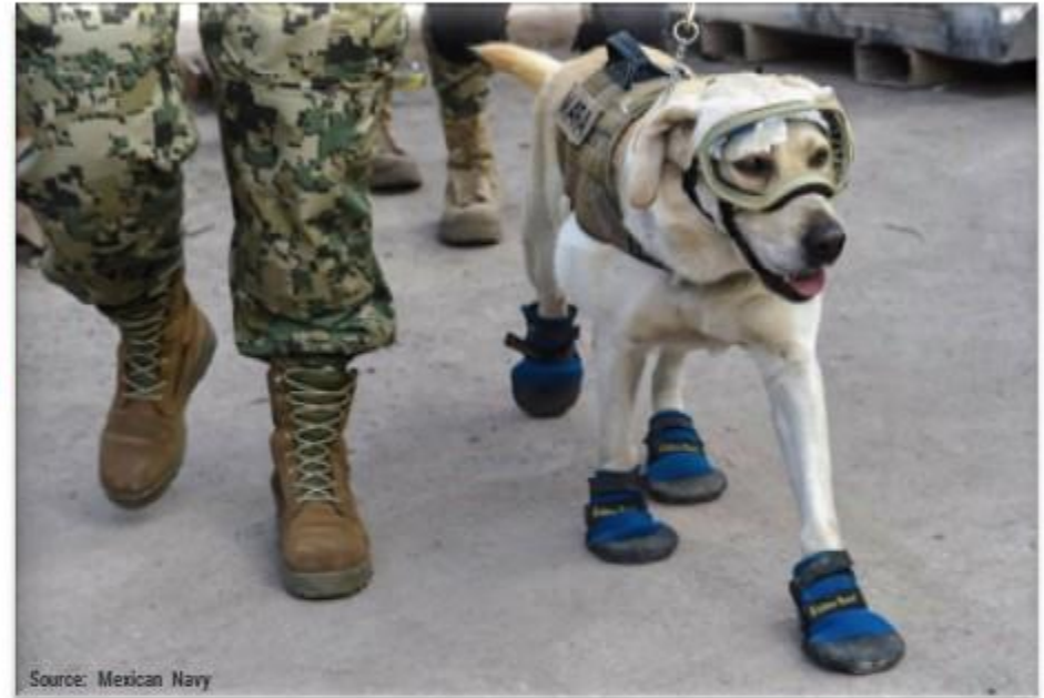
Pictured below: Frida the rescue dog