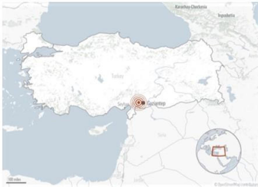
Pictured above: The location of the two earthquakes

The two massive earthquakes affecting Turkey and Syria have had a huge impact on the countries. At least 2,800 buildings are thought to have been destroyed and schools in 10 cities are to be shut for a week to keep people safe. Many airports have been closed as well. The earthquakes were also felt in other countries, including Cyprus, Lebanon and Israel.